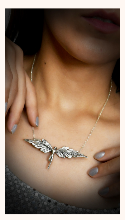
Remember the Flight 2